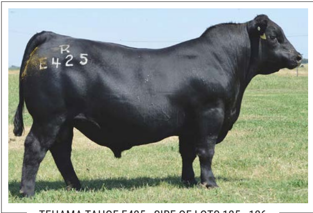
TEHAMA TAHOE E425 - SIRE OF LOTS 125 - 126