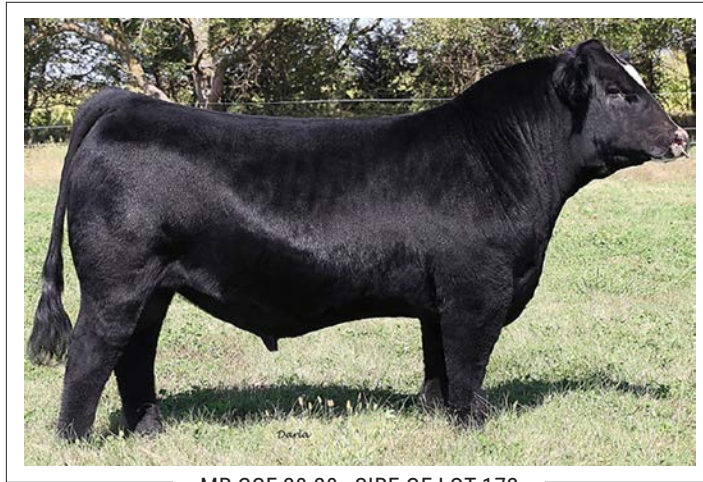
MR CCF 20-20 - SIRE OF LOT 172