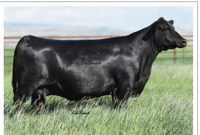
BASIN JOY 2006 - DAM OF THE SIRE OF LOT 3