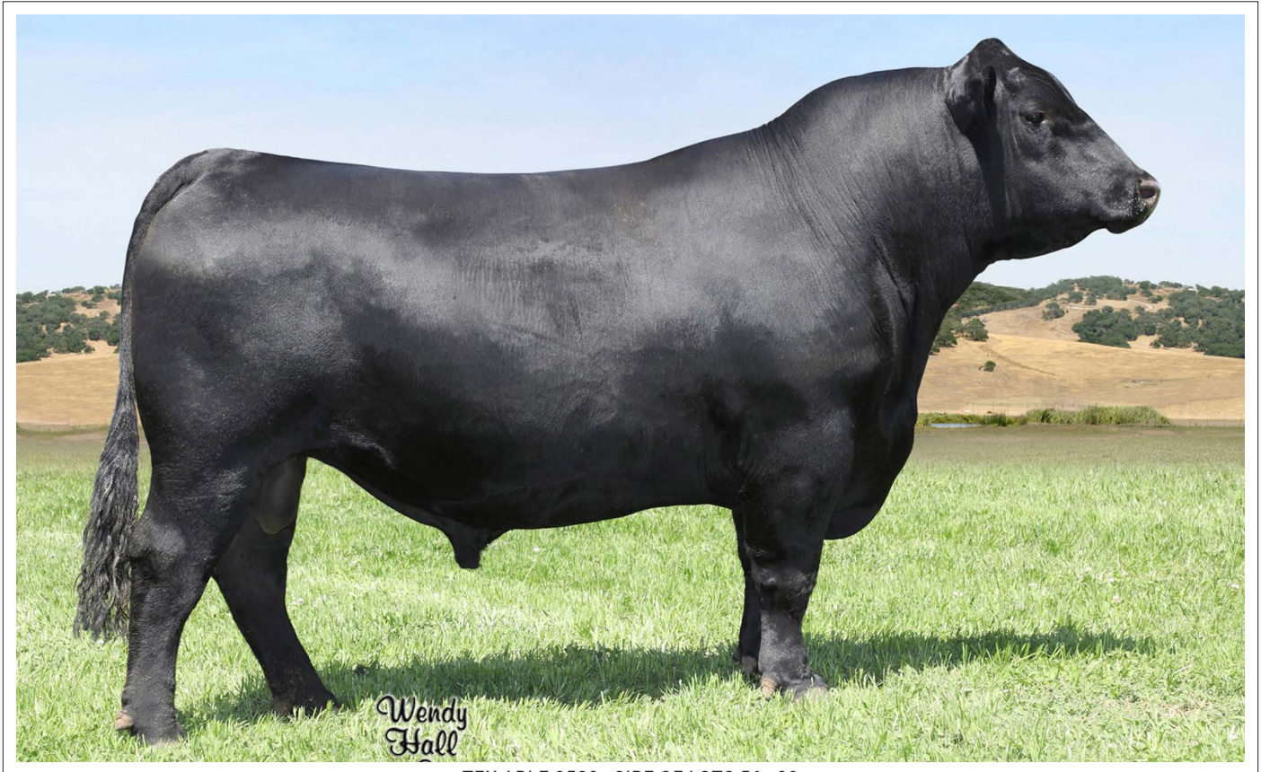
TEX ABLE 8528 - SIRE OF LOTS 56 - 89