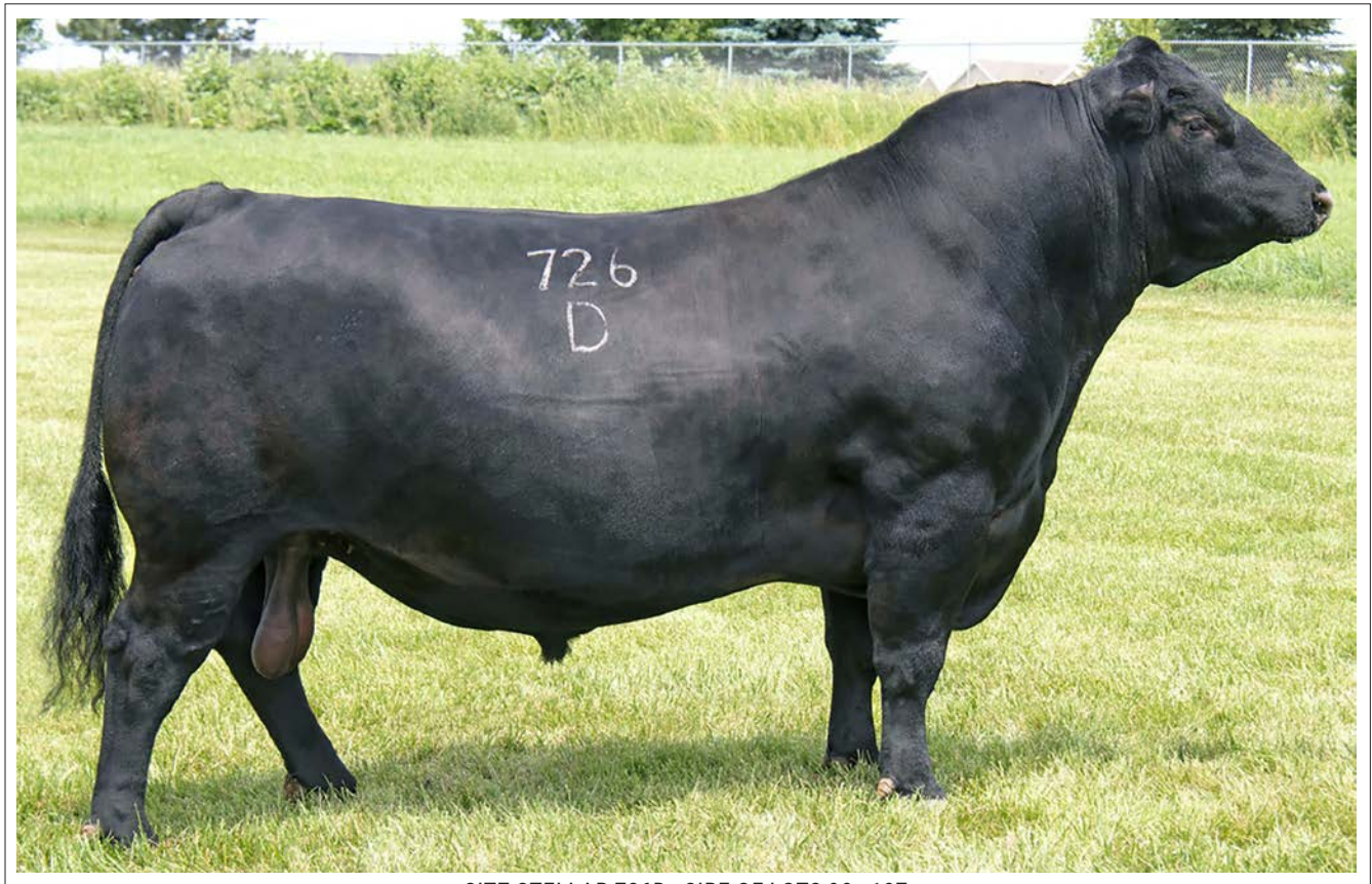
SITZ STELLAR 726D - SIRE OF LOTS 90 - 107