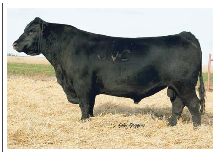
JVC CAVALRY V3326 - GRANDSIRE OF LOTS 108 - 119