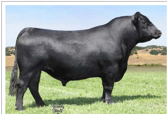
TEX ABLE 8528 - SIRE OF LOT 1