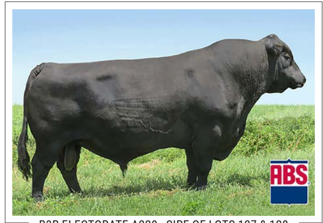
B3R ELECTORATE A229 - SIRE OF LOTS 127 & 128