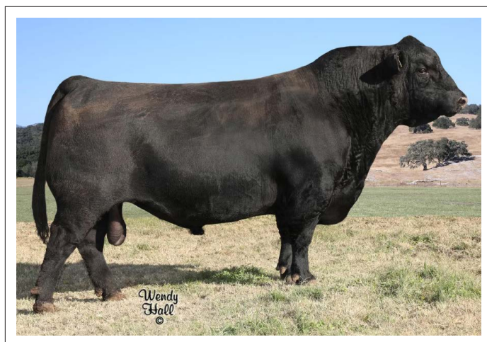
TEX PAYWEIGHT 7447 - SIRE OF LOTS 167 - 171