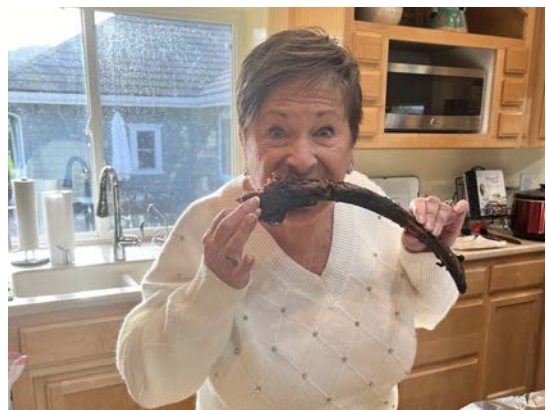
MOM ENJOYING ONE OF OUR TOMAHAWKS!