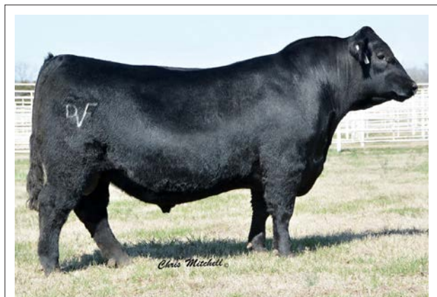
DEER VALLEY UNIQUE 5635 - SIRE OF LOTS 120 & 121