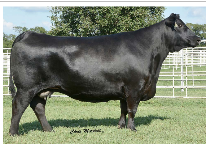
G A R PROGRESS 830 - GRANDAM OF THE SIRE OF LOT 1