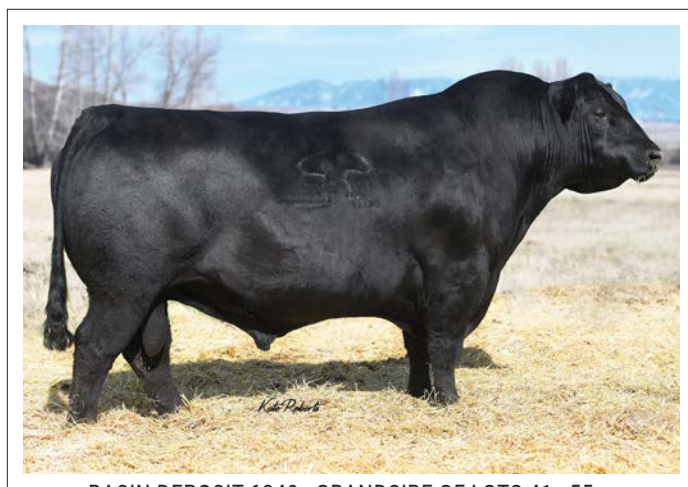
BASIN DEPOSIT 6249 - GRANDSIRE OF LOTS 41 - 55