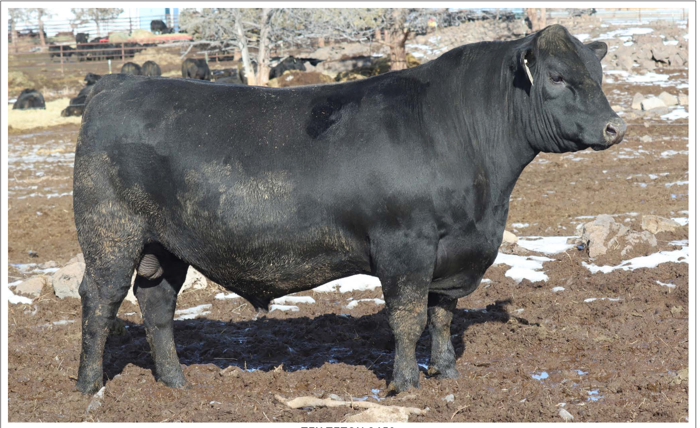
TEX TETON 2459