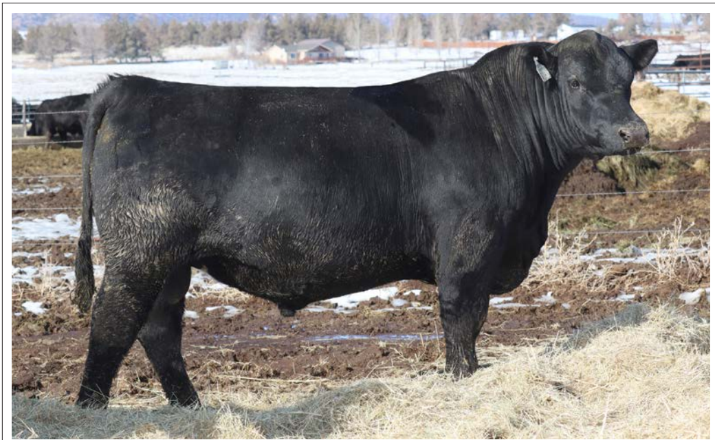
TEX ABLE 2407