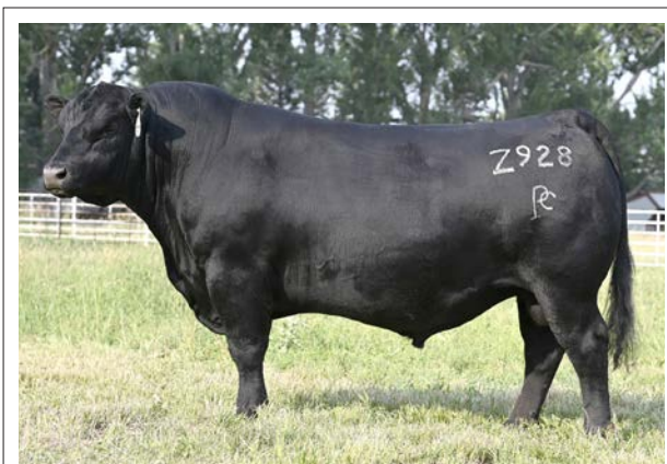
HPCA VERCINGETORIX - SIRE OF LOTS 122 - 124