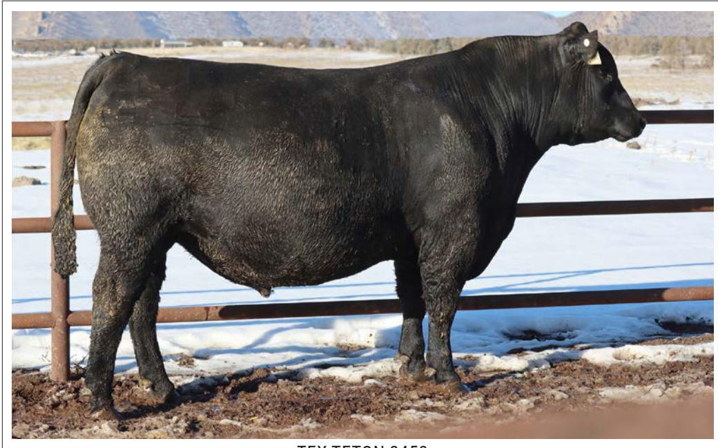
TEX TETON 2453