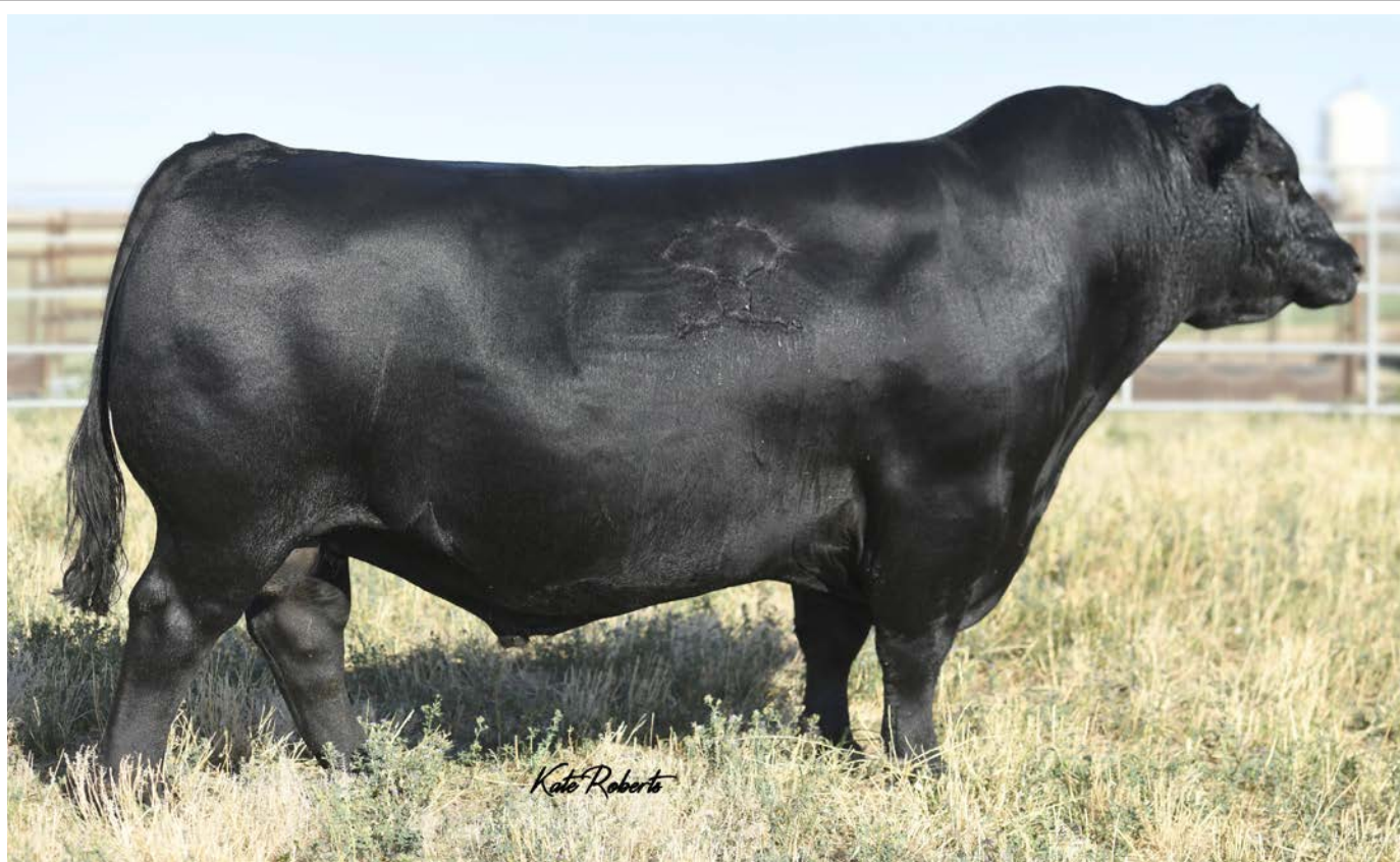
BASIN SAFE DEPOSIT 9324 - SIRE OF LOTS 41 - 55