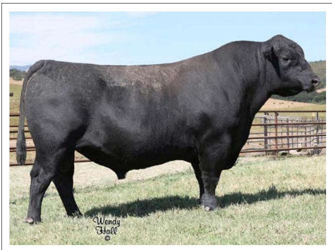
TEX NATIONAL 0108 - SIRE OF LOTS 146 - 155