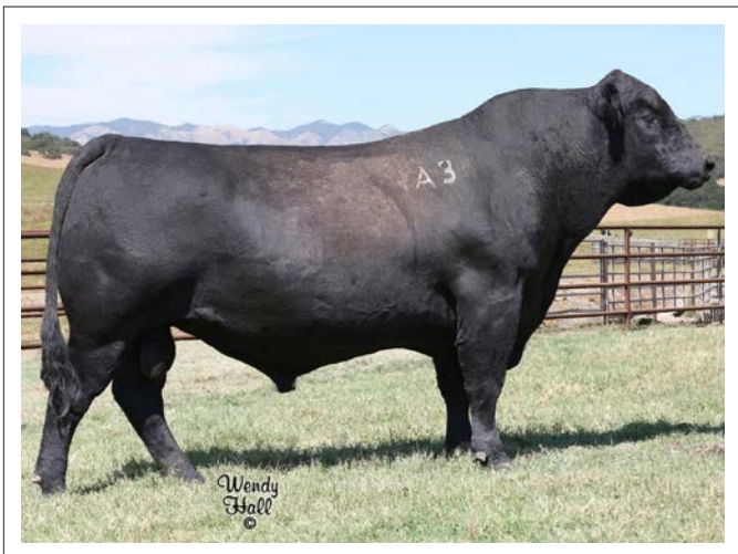
GARDENS MASTERPIECE - SIRE OF LOTS 131 - 145