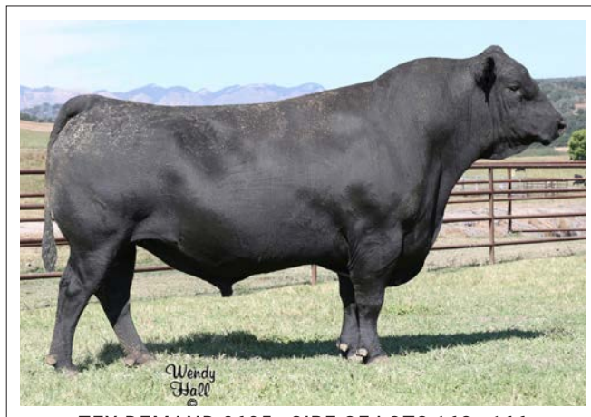
TEX DEMAND 8605 - SIRE OF LOTS 162 - 166