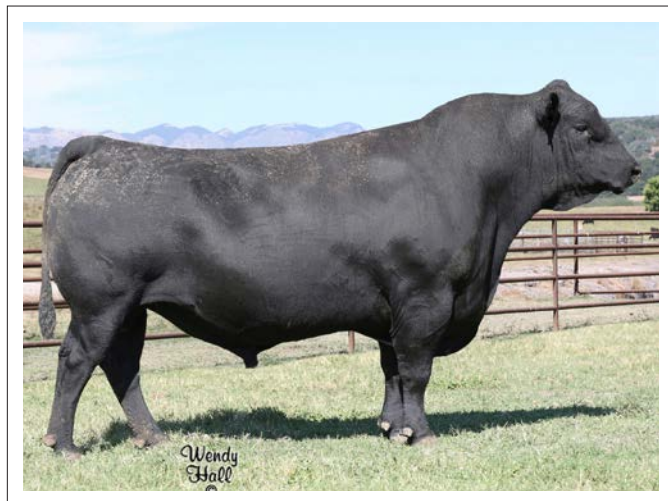
TEX DEMAND 8605 - SIRE OF LOTS 162 - 166