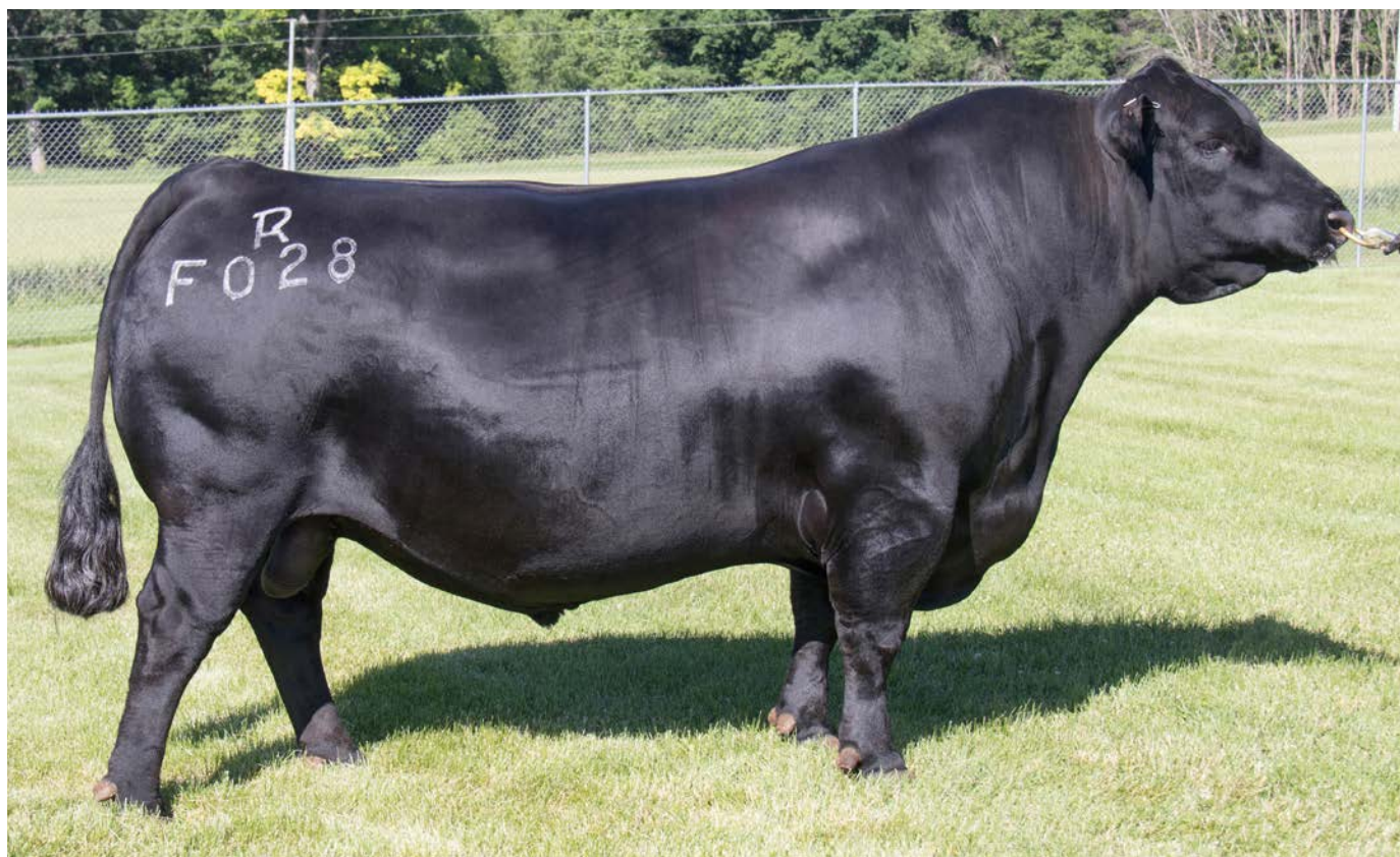
TEHAMA PATRIARCH F028 - SIRE OF LOTS 15 - 40