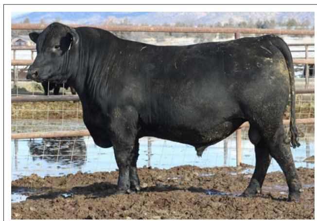
TEX DEMAND 2587