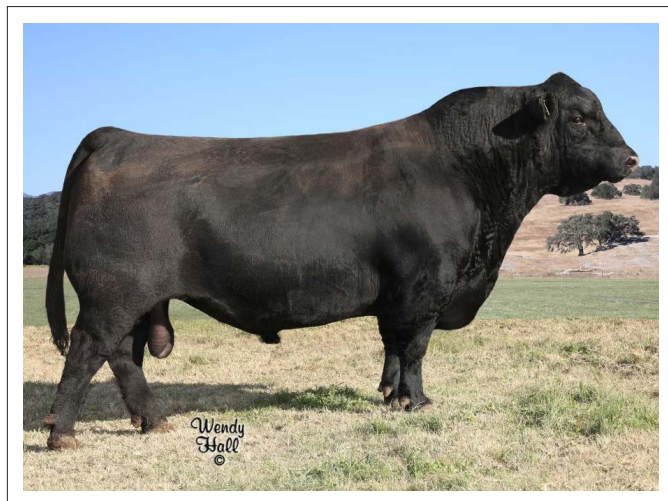
TEX PAYWEIGHT 7447 - SIRE OF LOTS 167 - 171