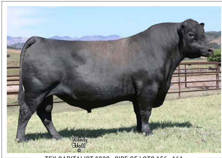
TEX CAPITALIST 0032 - SIRE OF LOTS 156 - 161