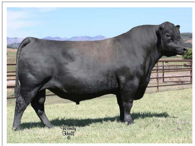
TEX CAPITALIST 0032 - SIRE OF LOTS 156 - 161