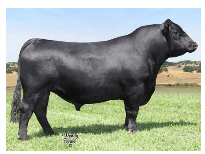
TEX ABLE 8528 - SIRE OF LOTS 56 - 89