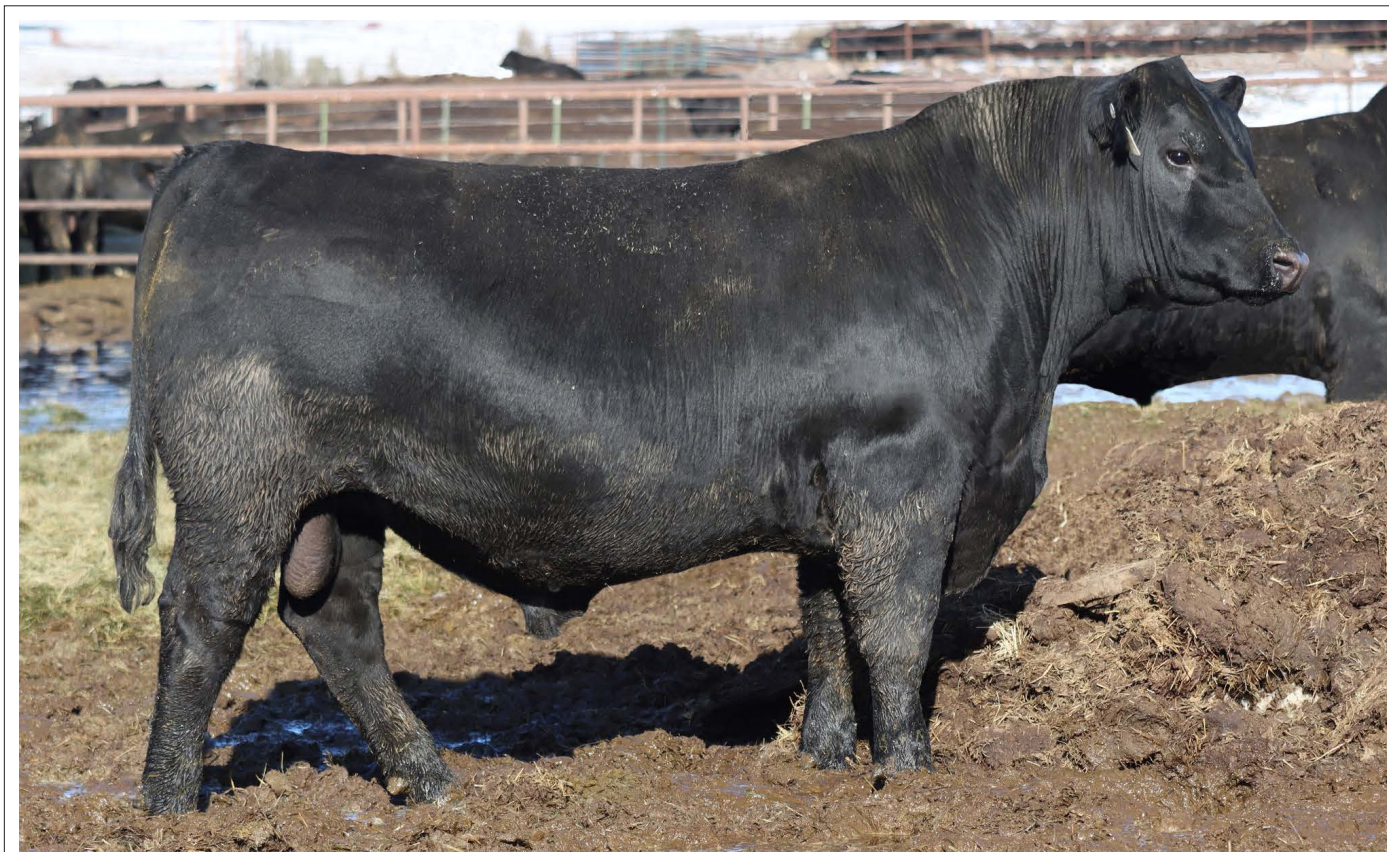
TEX ABLE 2465