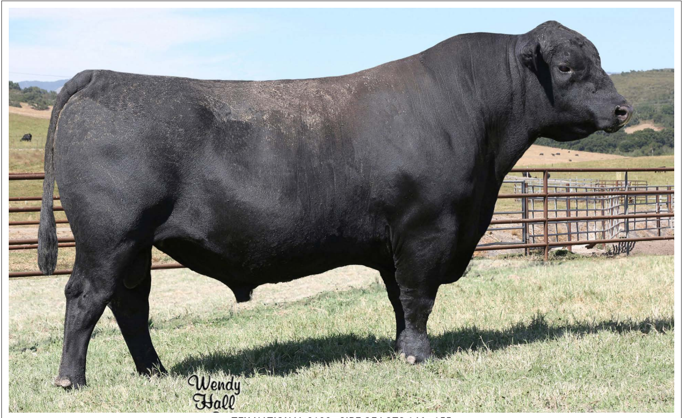
TEX NATIONAL 0108 - SIRE OF LOTS 146 - 155