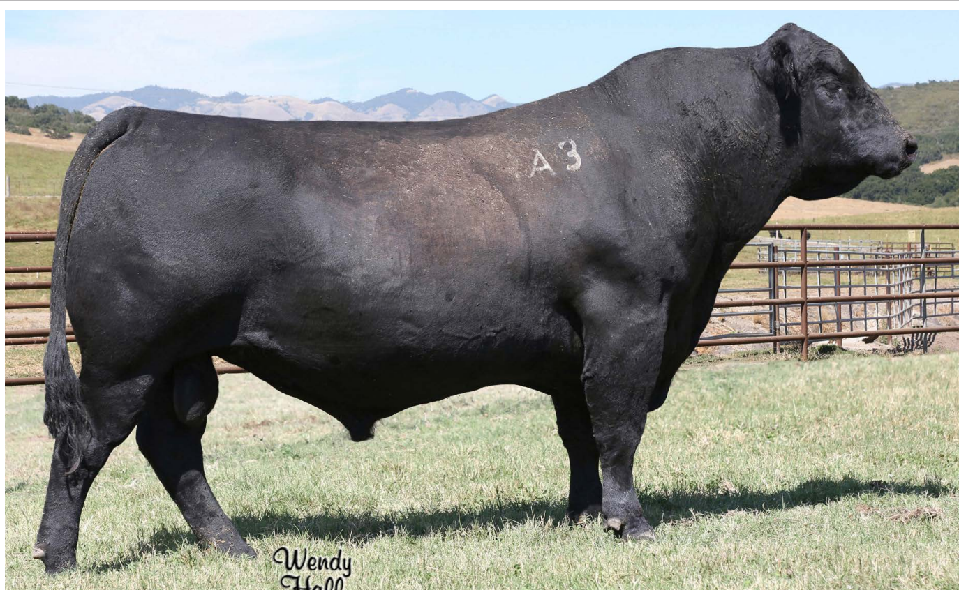
GARDENS MASTERPIECE - SIRE OF LOTS 131 - 145