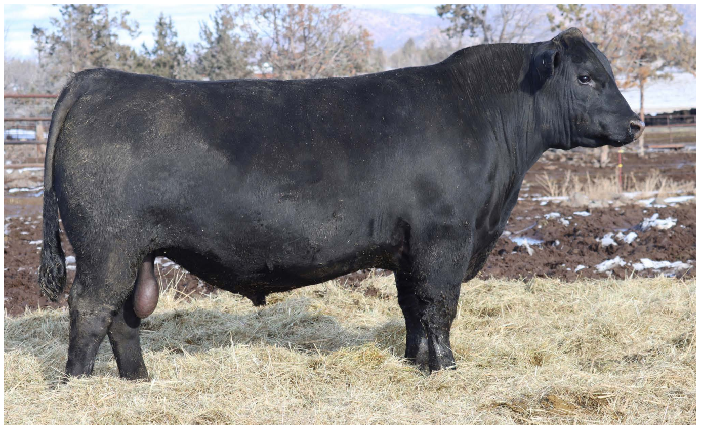
TEX SAFE DEPOSIT 2901