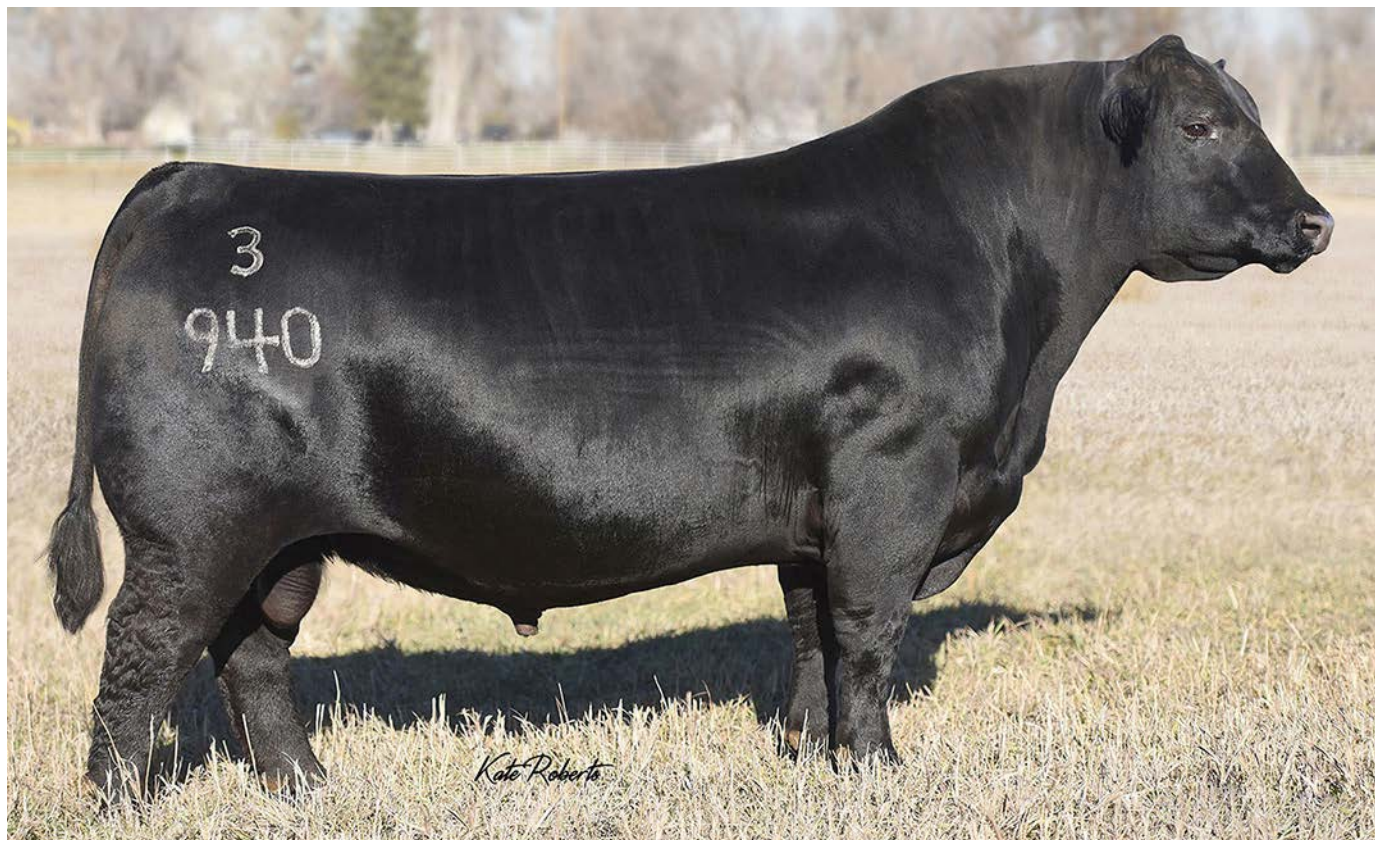
CONNELLY CONFIDENCE PLUS - GRANDSIRE OF LOTS 6 - 14