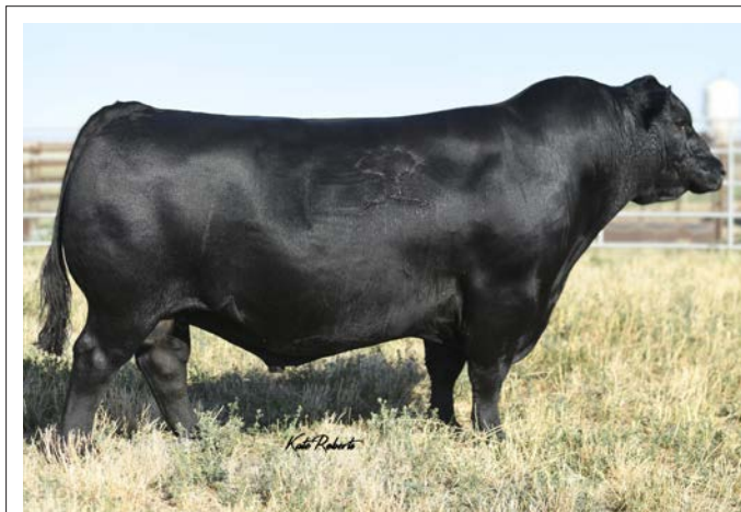
BASIN SAFE DEPOSIT 9324 - SIRE OF LOT 3