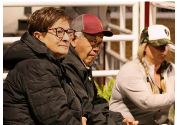
NANA, PAPA & MOM WATCHING THE BOYS SHOWING